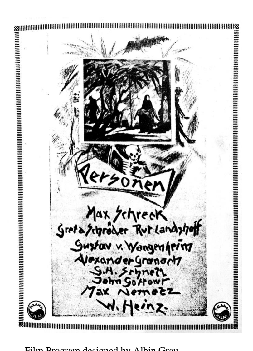
Film Program designed by Albin Grau

For Nosferatu's film-historical context, consult Hans Helmut Prinzler's The Chronicle of German Film (1918-1933) here and select 1922.